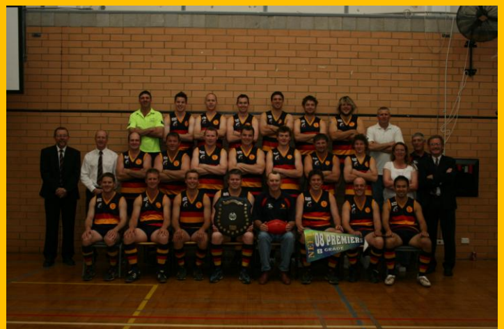
2008 B Grade Premiers